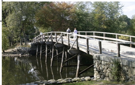
Current view of Old North Bridge in Concord

Thus began 8 long years of our struggle for independence.